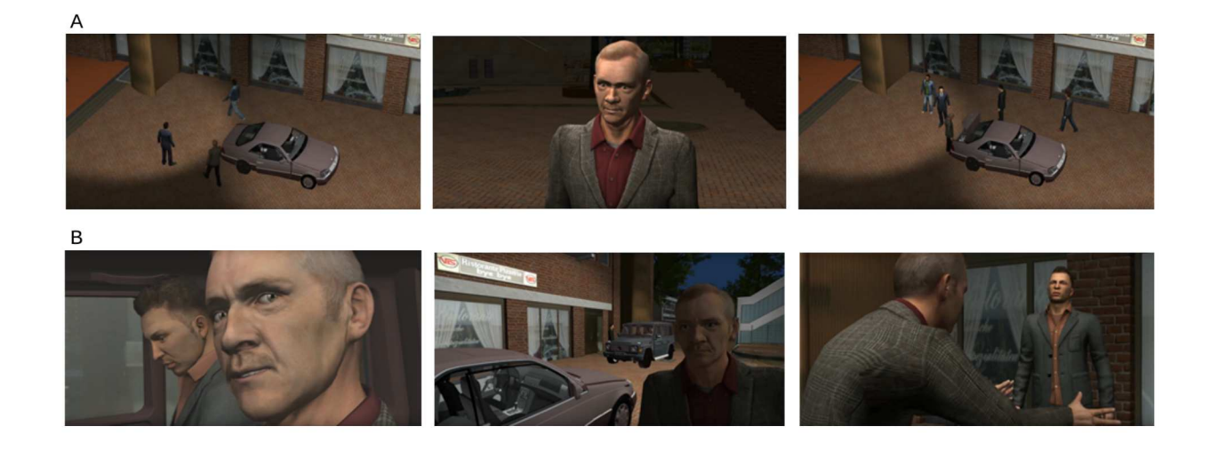
Figure 2: Sequences A and B are camera shots sampled from different versions of the same film created by a film director. A has good individual shots but sequences in the film are discontinuous and do not follow editing patterns. B contains sequences developed to adhere to editing patterns. This results in matched visual details across shots and improved focus on events.